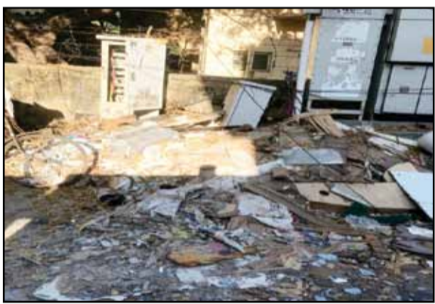
House wastes and construction wastes like doors are being disposed near the electricity pole and

transformers in W Block 1st street in Anna Nagar. This not only poses danger for the people disposing the garbage but also the ones involved in removing these garbages. Careless disposal from the public is the root cause behind this. The corporation must also take steps to install dustbins in the vicinity. This might bring the behavioral change among the people.